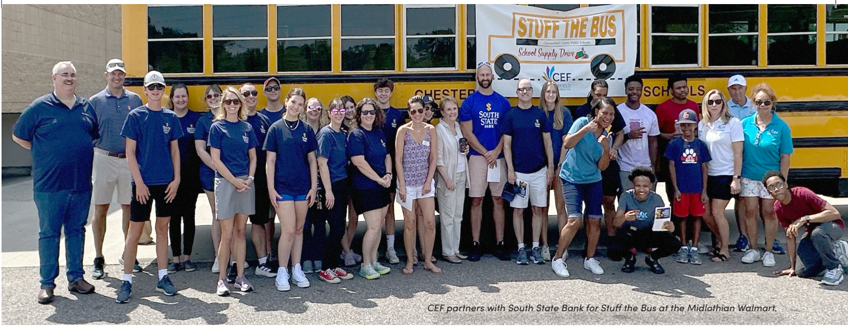
CEF partners with South State Bank for Stuff the Bus at the Midlothian Walmart.